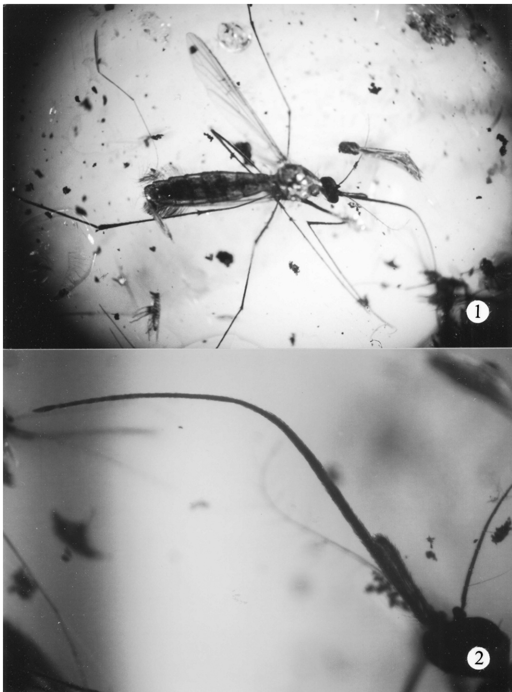
Figs. 1-2. Holotype female of Toxorhynchites mexicanus in Mexican amber. 1, Whole mosquito. 2, Head.