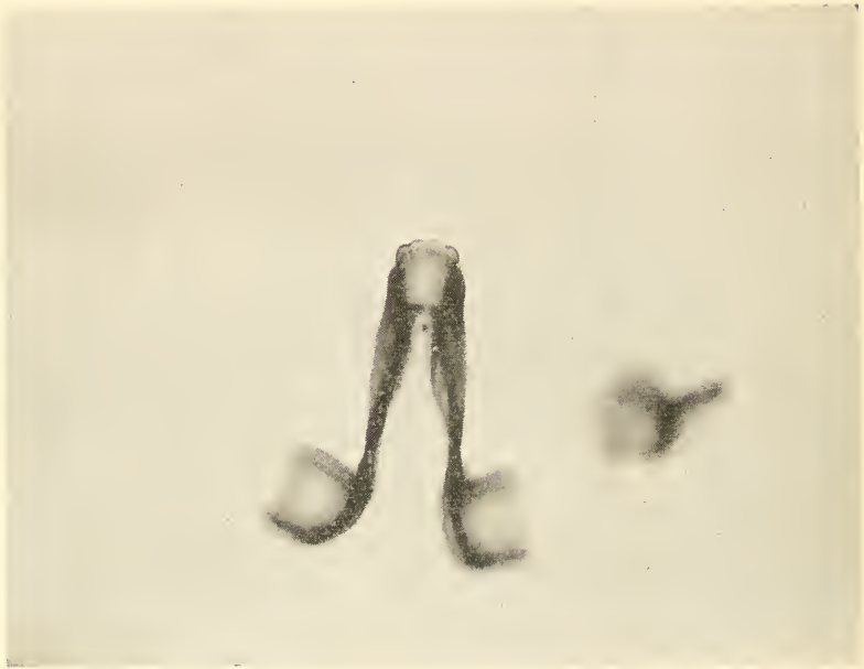
Fig. 4, Micrograph of mesosome of type male.

Type .—One male, the terminalia dissected and mounted on a separate slide.