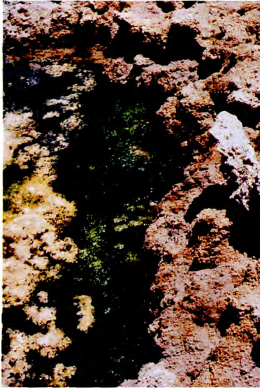
Fig. 3. Typical breeding site of Anopheles (Celia) ainshamsi near Râs Shukeir on the Gulf of Suez coast.

detritus (Haliday) also occur in these habitats. The type series consists of larvae and specimens reared from larvae and pupae collected from salt encrusted pools and drilled holes ranging from 0.2–2.0 m in diameter. A typical saline pool inhabited by larvae is shown in Fig. 3.